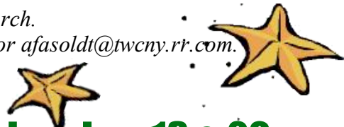
Photo editing workshop Jan. 13 & 20

More information: (315) 635-4641, or afasoldt@twcny.rr.com .